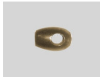
Bullet Pulling Eye